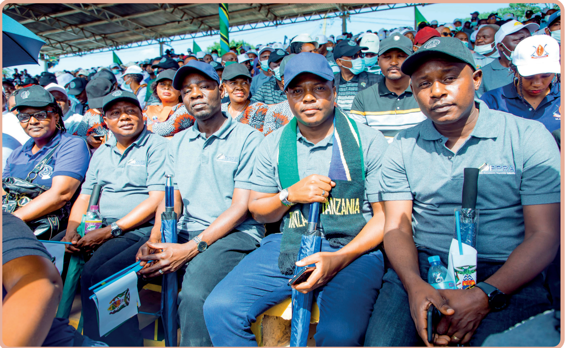
PPRA Staff attend International Workers' Day (Mei Mosi) Ceremony in Dodoma, which was graced by Her Excellence President Samia Suluhu Hassan