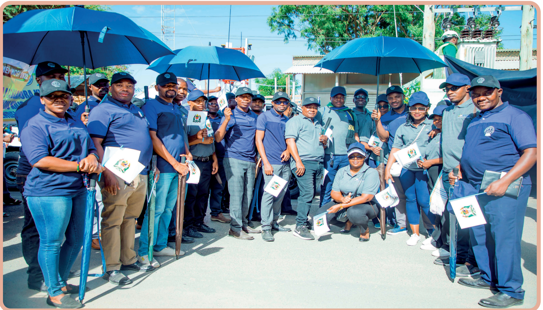
PPRA Staff in a group photo at the International Workers' Day event in Dodoma